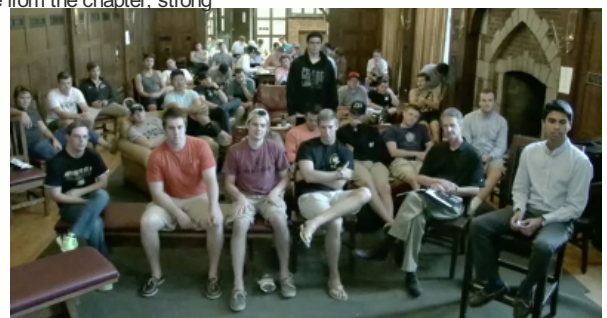
Undergrads fill the Great Hall for the recent Fireside Chats.