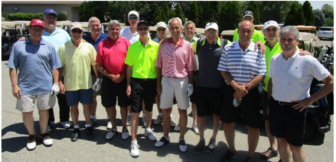
Class of '77 plays a little golf while celebrating their 40th reunion.

It was a perfect day for the 27th Annual Delta Delta Alumni Golf Outing held on June 11. Playing the recently remodeled Ackerman-Allen Purdue course, designed by Pete Dye, was fun and not too challenging. The over 70 brothers who returned enjoyed a great day of golf and sharing time with their pledge brothers.