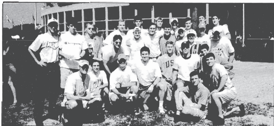
Twenty-one Delta Delta brothers ventured to Michigan State to cheer on the Boilermakers in the football season opener.