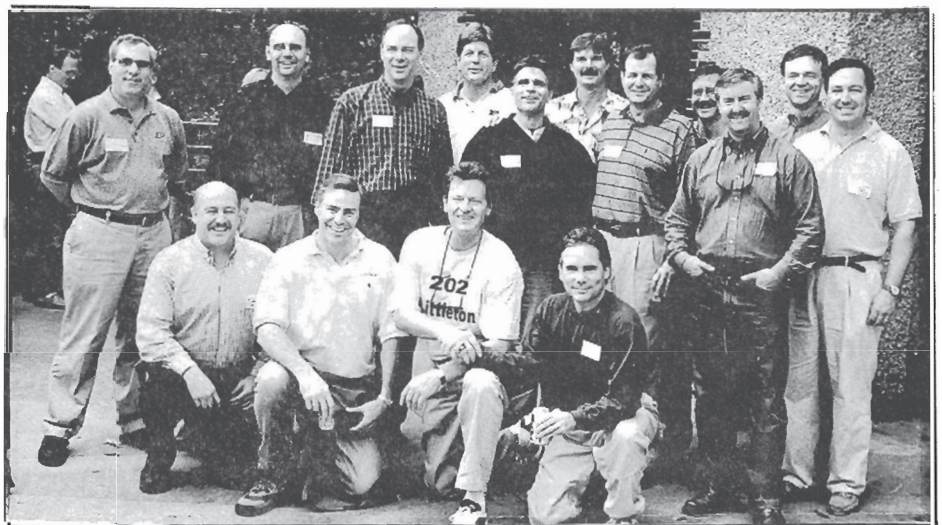
From Honolulu to Lafayette the Class of '74 returned to 202 Littleton Street at Homecoming '99 to celebrate their 25th Reunion.

In addition to the half time celebration, the astronauts were special See Harbaugh . . . Page 5