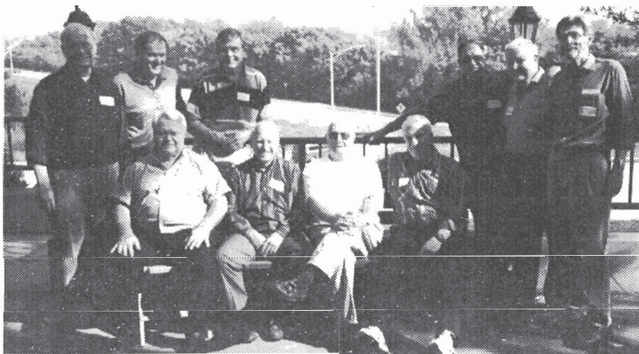
Several members from the Class of '57 gathered for their 45th Reunion.