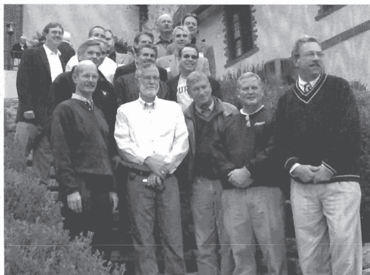
The Class of '77 celebrated its 30th Reunion at the Dedication Gala on Oct. 13.