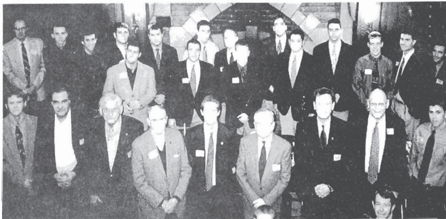
Alumni and undergraduate brothers congregate in the Great Hall at this years Brotherhood Dinner hosted by Delta Delta.