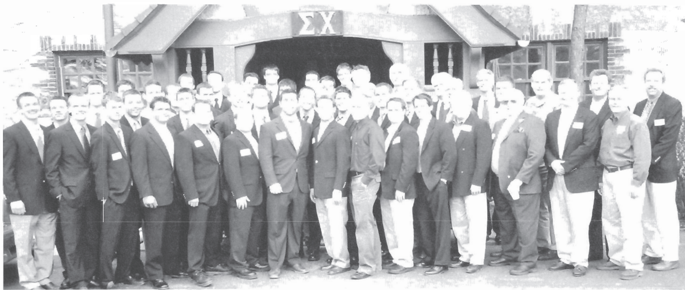
Many of the alumni and active brothers in attendance gather outside the chapter house prior to the start of this year's annual Brotherhood Dinner.