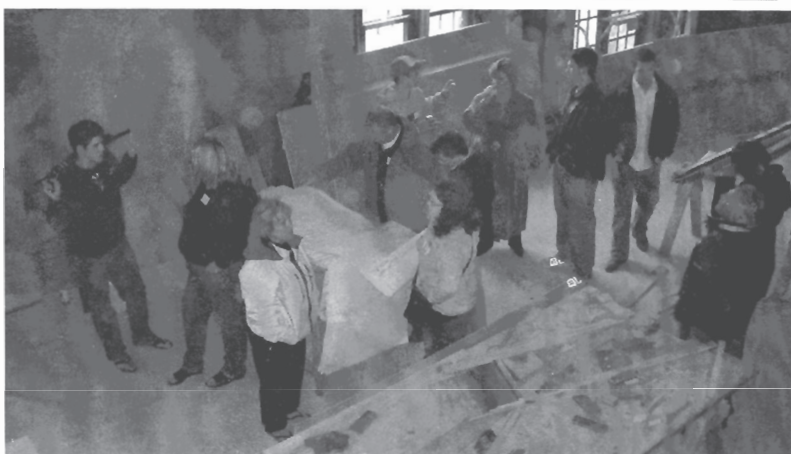
Moms, Dads, guests and brothers took the opportunity to tour the chapter house in April.

Delta Delta. When you have an opportunity to see what is being done to ensure our chapter's legacy and what the undergraduates will