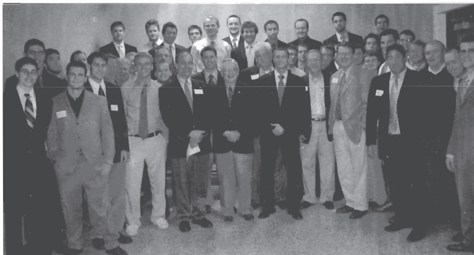
Alumni and undergraduate brothers gather at the Annex to enjoy the spirit of the 15th Brotherhood Dinner.