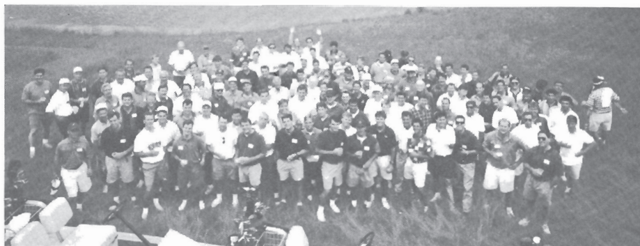
Over 130 members of Delta Delta participated in the 1994 Alumni Golf Outing held at the River Glen Country Club, near Indianapolis.