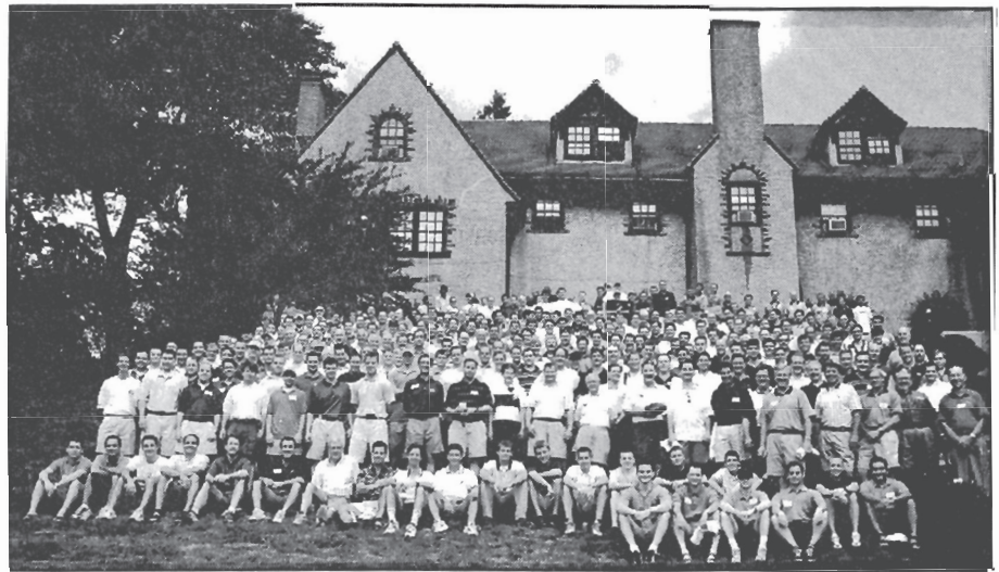
Many of the almost 400 Sigs who returned to Delta Delta for its 125th Anniversary congregate in front of the chapter house for the Grand Reunion John T. McCutcheon predicted.