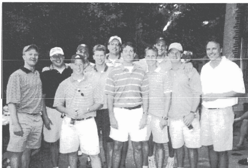
Best Class Participation went to the large contingent from the Class of '94.