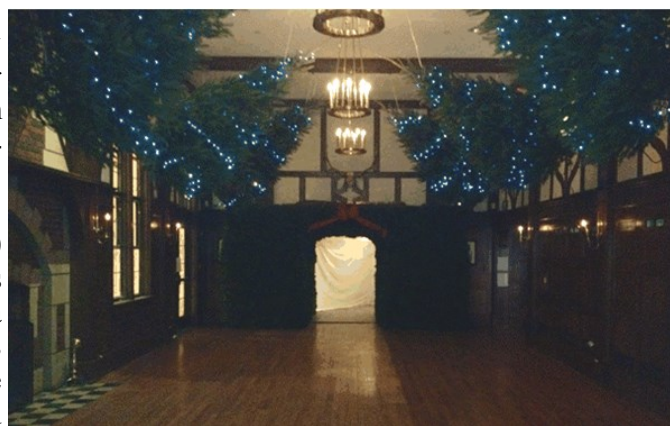
The Great Hall awaiting the arrival of Blue Formal guests.

The Christmas spirit is alive and well at 202 as we begin preparations for our annual Blue Formal celebration on December 2 nd . We look forward to the smell of pine trees and the sound of Christmas music in the Great Hall.