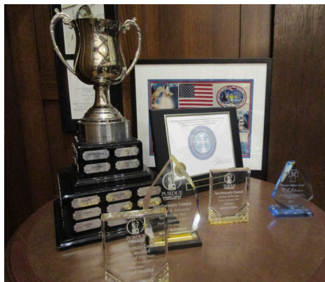
2016—2017 Chapter Awards

At this year's annual Brotherhood Dinner, the alumni in attendance had a chance to hear about some of the recognition Delta Delta and the brothers had received over the past