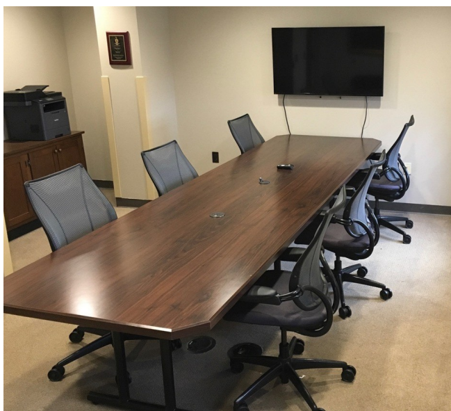
The new Presentation Room is a popular place to study.

The upgrades to this room provide a comfortable setting for