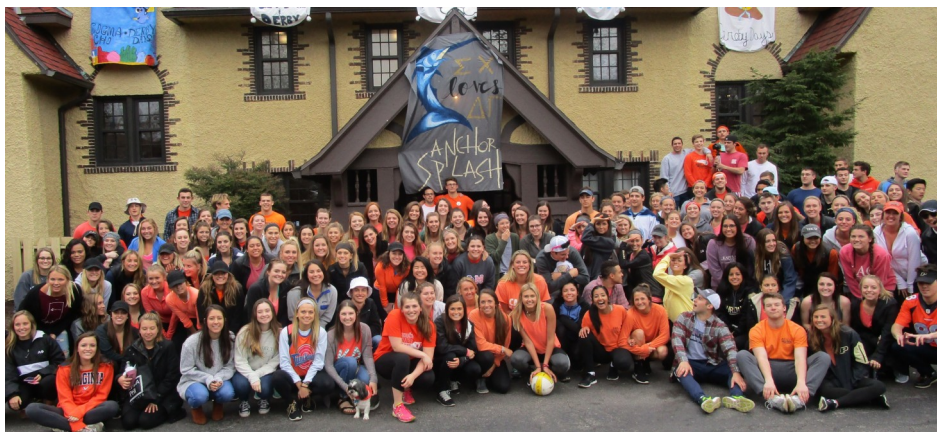
Derby Days this year was a huge success raising almost $10,000 for charity.