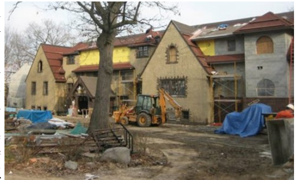
The chapter house under renovation in 2006/2007.