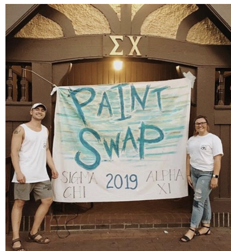
Sigma Chi and Alpha Xi had fun together raising funds at the first Paint Swap.

I am excited to serve as the next Consul of the Delta Delta, and I look forward to working with alumni and the undergraduates to have another successful semester. I am very thankful for all the time and hard work our alumni, House Corp, and undergraduates have put into the house. We are excited to see what the Spring semester has in store for Delta Delta.