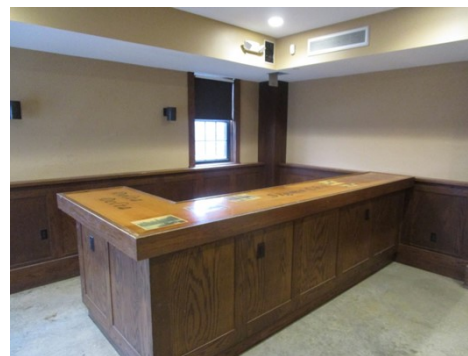
The bar in the Activity Room was relocated to open up the room.

The Rolling Peanut Pub, Delta Delta's in-house bar, once resided in what is now the Eldridge Room. It served as a gathering place for the brothers for almost two decades. During the 2006-2007 renovation of the chapter house the Roll-