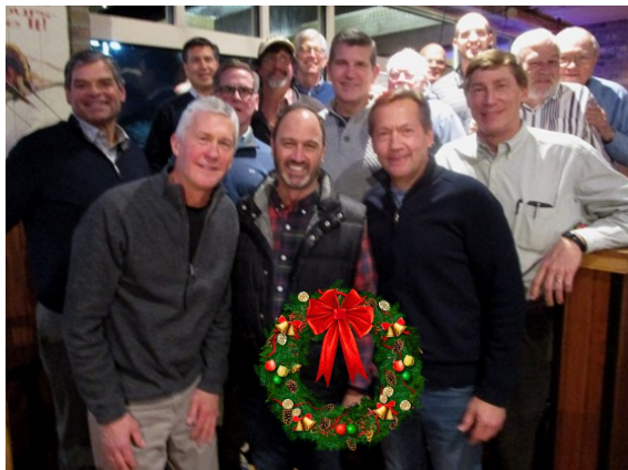
A number of the Sigs who gathered at the annual Delta Delta Get Together posed for the camera.

Over 25 Sigs stopped by to "raise a jolly bumper" to the brothers and to wish them a Merry Christmas. Catching up was the main topic of conversation as everyone enjoyed hearing what was going on in each other's lives. There was also the occasional reminiscing of our days at Delta Delta and inquiring about pledge brothers who were not present.