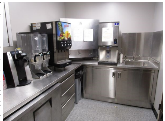
The Night Kitchen has new stainless steel cabinets and countertops.

upgrades totaled $42,000 which were paid for from the Annual Fund.