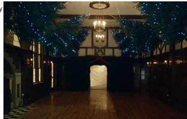
The Great Hall glistens with the traditional Christmas Tree canopy.