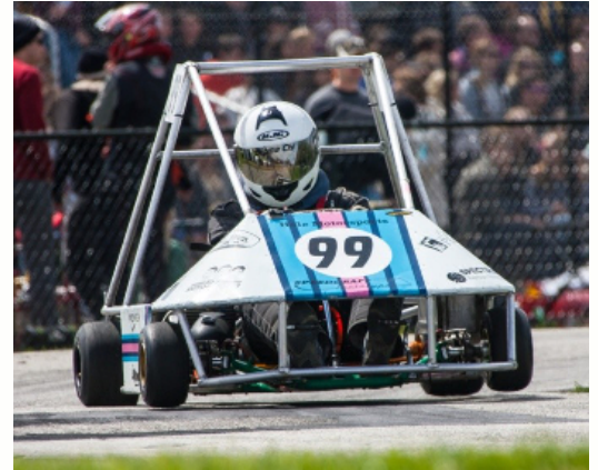
Sigma Chi takes to the track for the 60th time.

The team is already looking forward to #61!