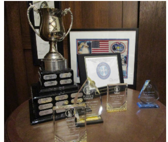
Chapter Recognition Awards for 2016-2017

At the Annual Purdue Greek Awards, Delta Delta brothers received the top Fraternity awards.