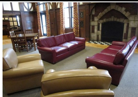
The Great Hall floors were sanded and restained with new carpet and reupholstered furniture.

To see many more photos of the updates go to News & Events, Alumni at www.thesighouse.com .