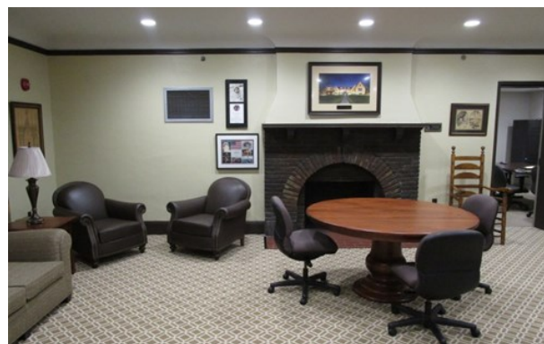
The Library was completely refurbished with new carpeting, paint and furniture.