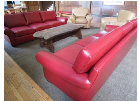
Great Hall couches, chairs and benches all were reupholstered.

Most of the interior of the house received a fresh coat of paint and all the vinyl tile in the hallways was stripped