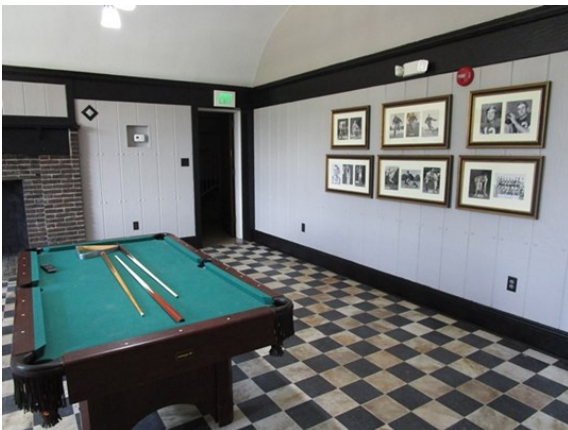
The Game Room got a new look this summer.

the annual fund, more routine cleaning and repairs are paid by the House Corporation, and extraordinary damages come out of the undergrads damage deposits.