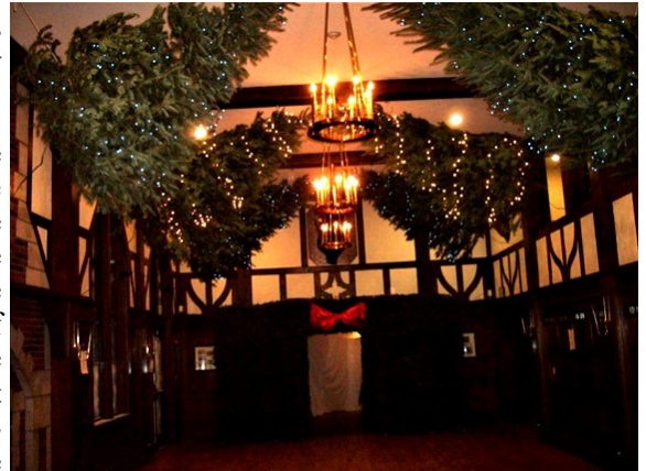
The Great Hall has been decorated for Blue Formal similarly for over 60 years.

We also learned that Blue Formal was "black tie" until the late '60's; the announcement of the Sweet-heart continues; that procuring extra trees at little to no cost has been going on for years including cutting pine branches off trees in the Lafayette Police shooting range; and the more recent "tradition" of taking down the Game Room pine bough arch at 3 am following the dance with the participating brothers wearing only their boxer shorts. We also learned that the brothers continued the Blue Formal tradition