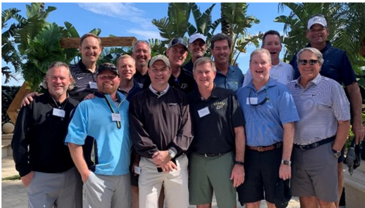
Sigs enjoying some golf and sun at the JPC golf outing.

A group of Sigs from the Class of '95 also took part. Although not as successful on the golf course these brothers enjoyed a couple of days of just hanging out.