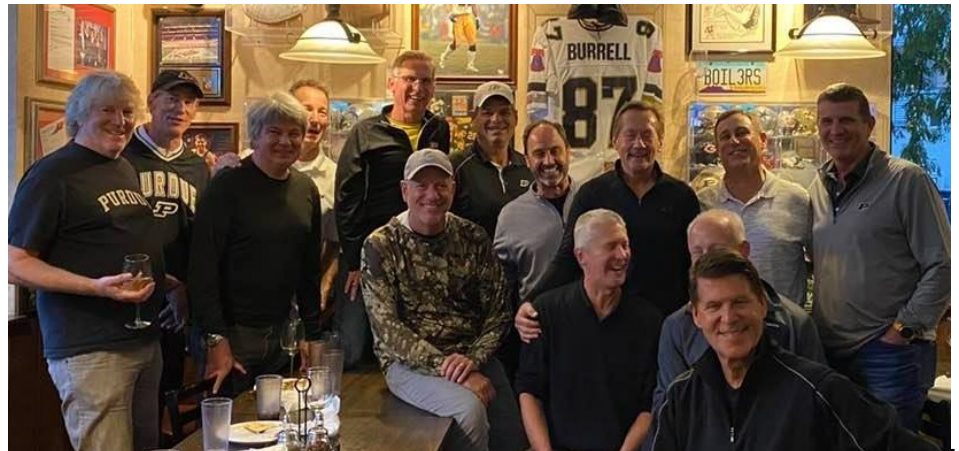
The Class of '81 met for a reunion dinner at Bruno's over Homecoming weekend.