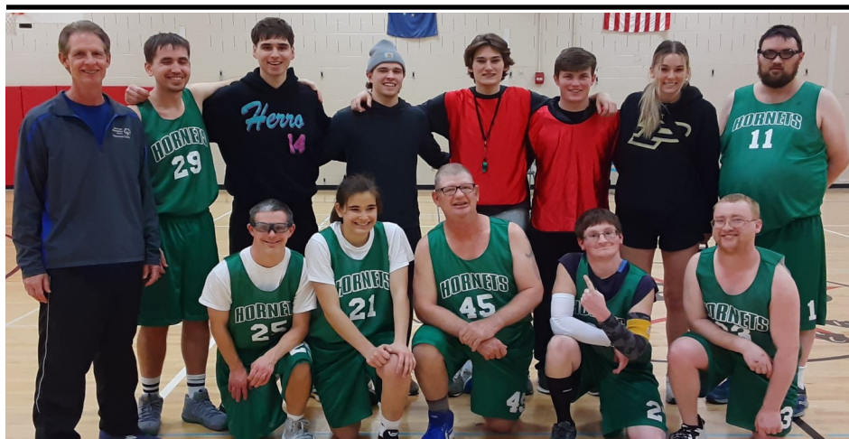
Several Delta Delta brothers recently helped officiate a number of Special Olympics basketball games. The athletes really enjoyed the Sigs participation.

Moral within the house is high as our activities are getting back to "normal." We have been able to organize a variety of brotherhood events such as wiffle ball and snow-bowl football game in the front lawn. In the fall we hosted an alumni dinner for over 100 returning brothers. Additionally, we are welcoming the return of Mom's Day and are excited to host the families of our brothers. Overall, we are very excited to see the return of many of our beloved traditions as student life becomes a little more normal on campus.