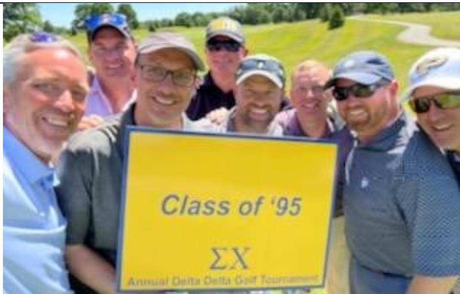
The Class of '95 enjoyed a great day at the Annual Sigma Chi Golf Outing.