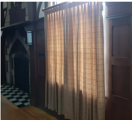
New Drapes in the Great Hall