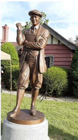
Statue of a youthful George Ade unveiled on June 26, 2022.

The George Ade Historic Preservation Commission was formed in 2017. Their vision is to create a one-of-a-kind landmark and unique historical tourism destination in Newton County, Indiana.