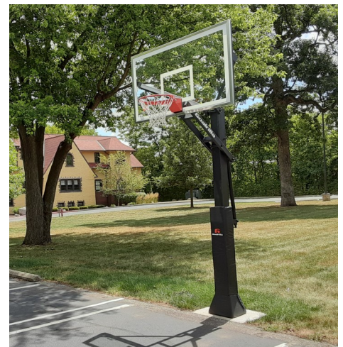
New Basketball Goal and Court Lines

rush activities that begin the first week of school.