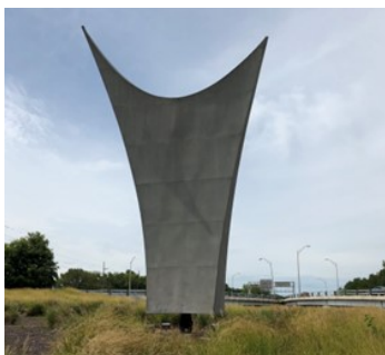
Dick’s Quabache Structure

Dick used his welding skills and creative nature to design and build unique