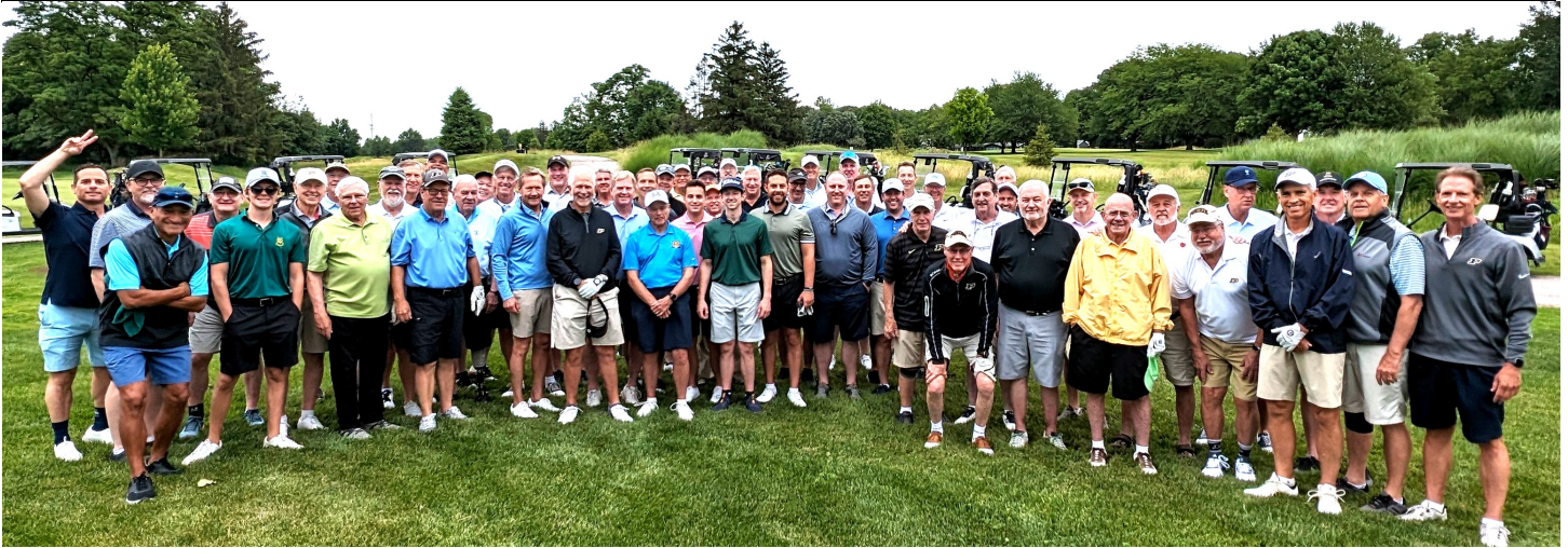
Sigs from all eras returned for the annual Delta Delta Alumni Golf Outing at the Kampen-Cosler golf course at Purdue.

Published by Delta Delta Chapter of Sigma Chi Fraternity at Purdue University.