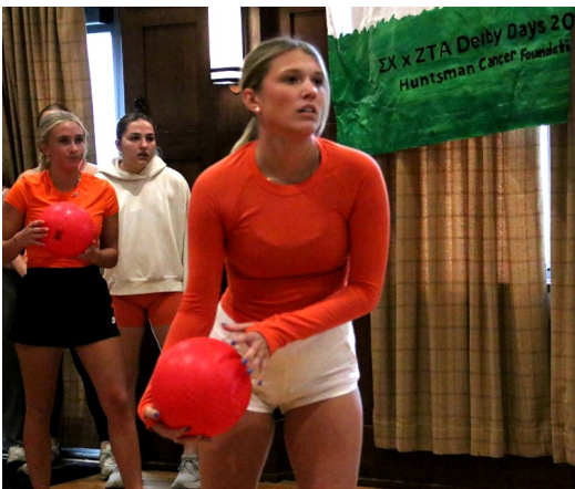
Derby Days participants raise funds for the Huntsman Cancer Institute.

Thanks to all the Sig families, alumni, and sororities who supported this year’s Derby Days event.