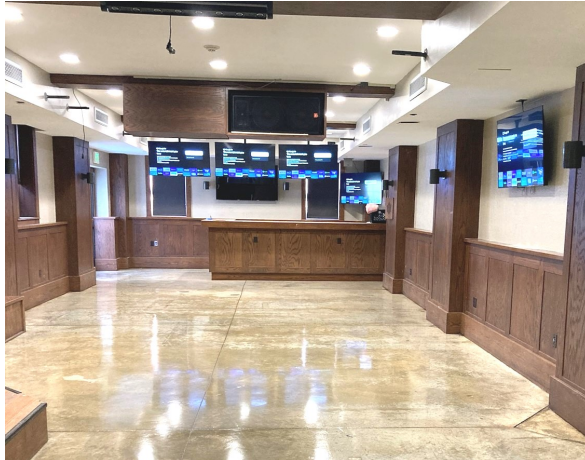
The refurbished Activity Room awaits the brothers.

To give the room a fresh look, Jay Milligan stripped the floor and gave it four coats of sealer and two coats of finish wax. A fresh coat of paint was also applied to the walls.