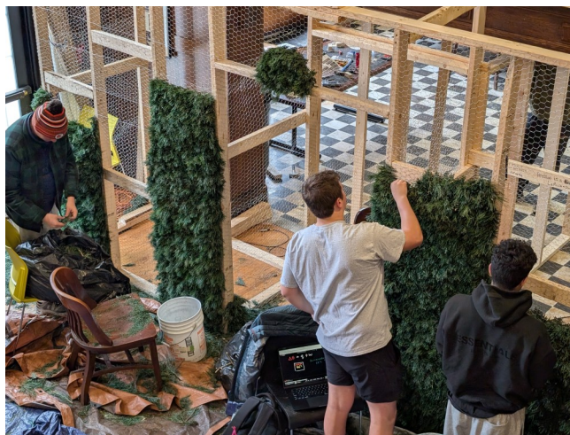
Building the evergreen arch for Blue Formal 2024.