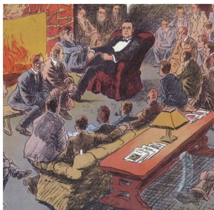
The Old Grad speaking with his younger brothers.

All that is required is a desire to support a Delta Delta brother as they find their way through their collegiate experience. The active chapter is seeking to match every brother with an alumni mentor, a program started last year that proved very beneficial to our younger brothers.